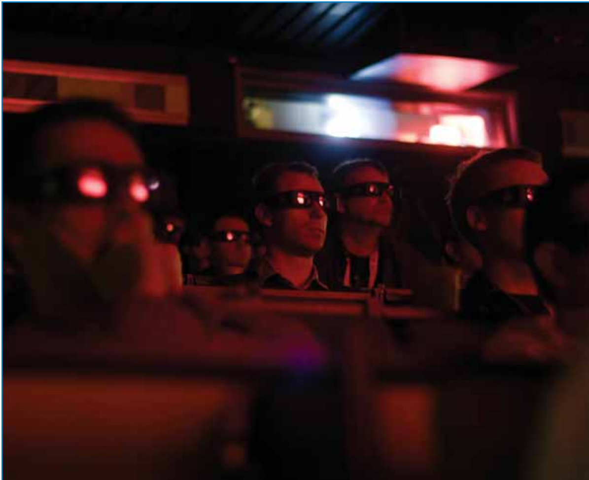
An audience uses 3-D glasses to watch a three-dimensional video projection.

"Projectors are a 10-year minimum investment," he said. "But if someone came to my district and said, 'I will sell you 3-D ready projectors for only $25 more than a regular projector,' I'd have to seriously consider it—because being 3-D ready is worth it."